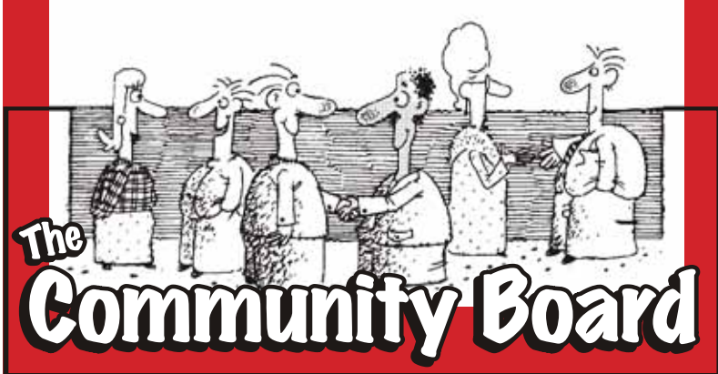
The Community Board The Plain Press Community Board is a listing of a variety of free activities and resources for neighborhoods served by the Plain Press. It is sponsored by Organize! Ohio through donations from readers and supporters.

CLEVELAND PUBLIC THEATRE STEP (Student Theatre Enrichment Program) is an arts-based job training program that engages Cleveland teens from low-income families in an 8-week intensive experience. Students ages 14-19 with little or no previous performance experience are eligible and earn money while learning and practicing valuable job skills and theatre skills. Auditions days and times are Saturdays, March 11 & 18 and Sunday March 19 th , from 1pm to 4 pm. Applicants must have an interest in theatre performance and/or set and construction, and prepare a 1-minute piece (dance, monologue, or song) to be performed at the audition. Call Adam Seeholzer, CPT Education Manager (216/631-2727, ext. 219), with name, phone number and an audition date you will attend. Registration for Youth Opportunities Unlimited (YOU) is strongly suggested to be completed before auditions. To register for YOU, visit http://www.youthopportunities.org