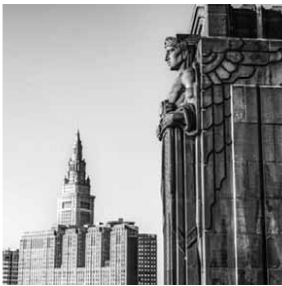
One of the Guardians of Transportation looms over the Terminal Tower in the background.