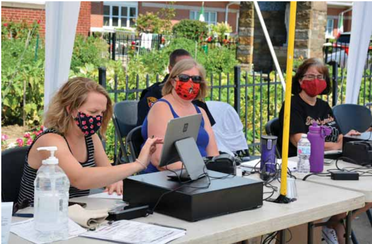
Saturday, September 5, 2020; St. Rocco Church, 3205 Fulton Road: Volunteers from St. Rocco's Parish keep track of food orders as cars filled with people line up on the parking lot to order traditional Labor Day Weekend Italian Festival foods such as zeppoli, sausage sandwiches, lasagna, spaghetti and meatballs, cannoli and lemoncello cake.