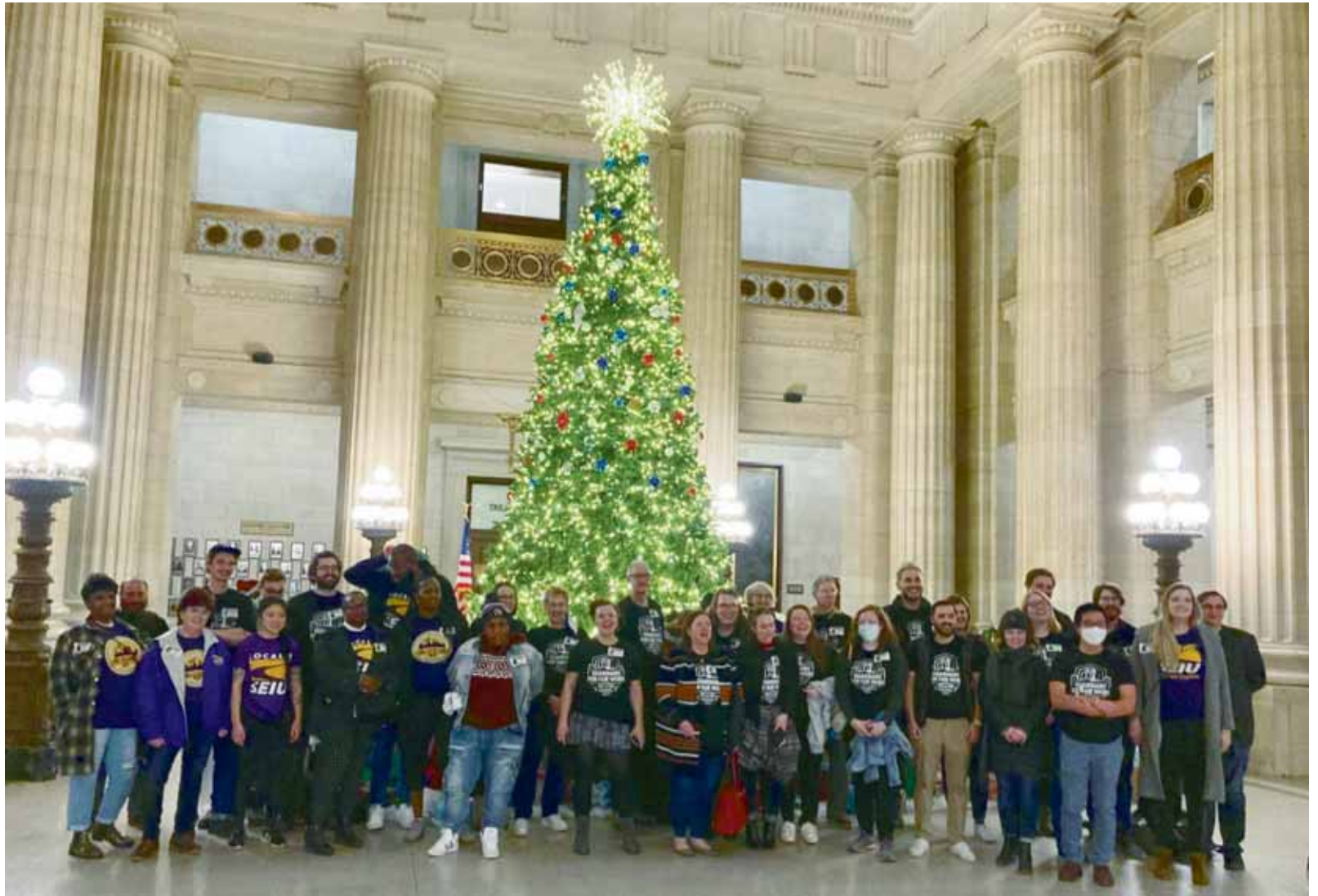
Monday, December 5, 2022; Cleveland City Hall Rotunda, Cleveland City Hall, 601 Lakeside Avenue: Members of Guardians for Fair Work pose for a group photo in front of the Christmas tree.

Under the Safe Harbor rule of the Revenue Act of 1978, a company can identify its workers as independent contractors. It can exempt employers from treating workers as employees. Companies that operate with the Safe Harbor rule do not need to