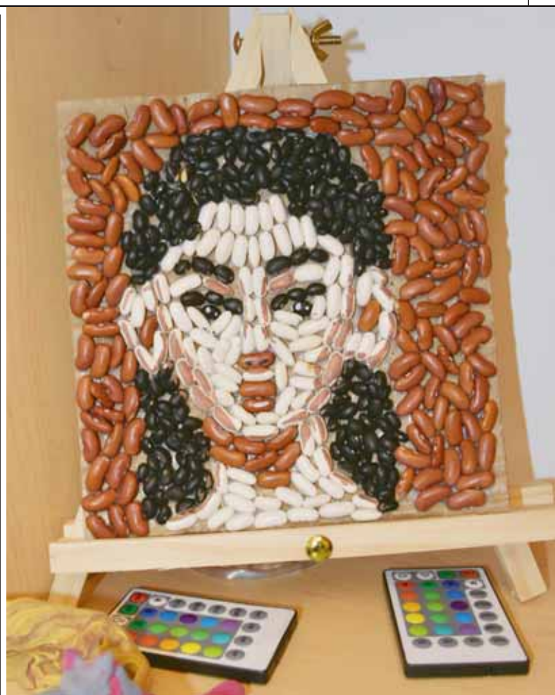
Sunday, January 7, 2024; Three Kings Day celebration, Cleveland Museum of Art Community Arts Center at the Pivot Center for Art, Dance and Expression, 2937 W. 25 th Street: This unlabeled artwork, an image of a person assembled using a variety of beans, sits on an easel in a community room where staff and volunteers from Julia de Burgos Cultural Arts Center offer supplies and work with community members on art projects for the Three Kings Day celebration.

IF YOU NEED SHELTER contact Cuyahoga County's Coordinated Intake office at 216-674-6700. Hours of operation: 8 am – 8 pm, Monday – Friday.