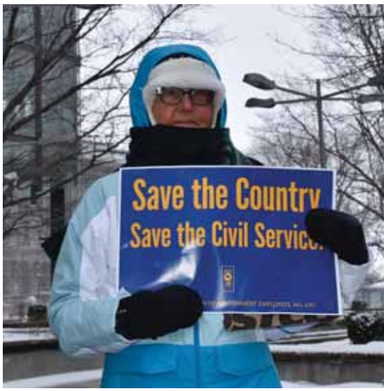
Thursday, February 20, 2025; Anthony J. Celebrezze Federal Building, E. 9 th and Lakeside: Protesters, protest firings of federal employees orchestrated by Elon Musk's Department of Government Efficiency. A member the Service Employees International Union joins with about 150 protesters to show her support for federal workers who lost their jobs.

Non Profit Organization U.S. POSTAGE PAID CLEVELAND, OHIO PERMIT 1354