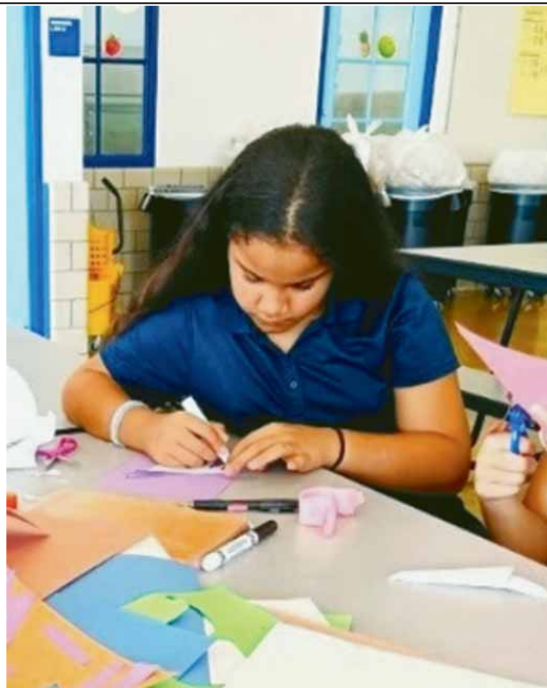
A student at Joseph Gallagher School receives academic support at the Boys and Girls Club at the school. The after-school program is made possible through a federally funded 21st Century Community Learning Centers Initiative.

FREE ESOL CLASSES: Aspire Greater Cleveland offers FREE beginner, intermediate and advanced-level